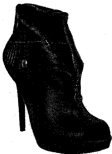
Alexander McQueen’s “Faithful Bootie”

and selling the “Faithful Bootie,” and after fashion-conscious consumers and the fashion trade had come to recognize the design of the “Faithful Bootie” and associate it exclusively with AMQ, Madden recently launched an identical knockoff of the “Faithful Bootie” called the “Seryna” Bootie, openly promoting it as an “unusual bootie” that is a “motorcycle jacket in a boot” and is “the next big thing for fall.” Side-by-side comparisons of AMQ’s “Faithful Bootie” and Madden’s “Seryna” Bootie appear below: