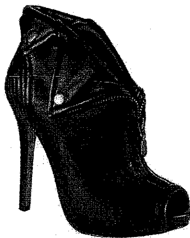
Steve Madden’s “Seryna” Bootie